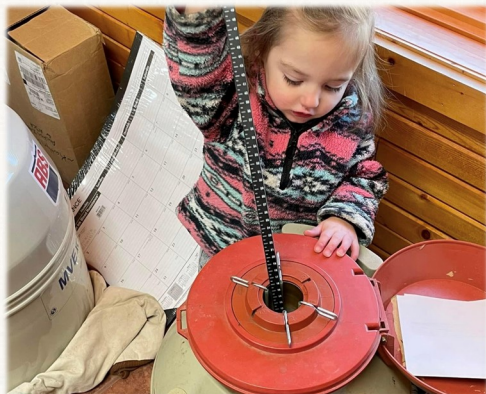
Blowing in the nitrogen tank is exciting with vapors going everywhere!

Double-bred to Resource – the unchallenged bull in the breed for true muscle shape I'd guess. Female-maker here. Overdrive daughters are nice-uddered, and the Miss family is our best.