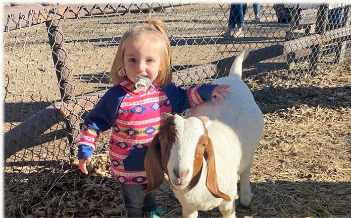
Better to get it out of their system when they are young!

Set of older cows that you would like to get a little more 'jump' from? We have customers that use white bulls on older, lower-performing cows. The Charolais 'edge' gets a producer those extra pounds.