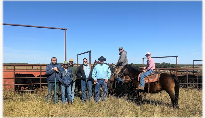
Berges Ranch. Customers for 40 years.

Join us, Friday evening, April 8, for the pre-sale social at the Fink Beef Genetics sale facility. Refreshments, gambling, and visiting.