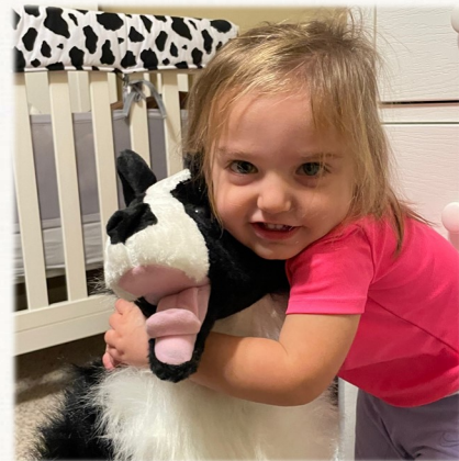
Border Collie Trainer