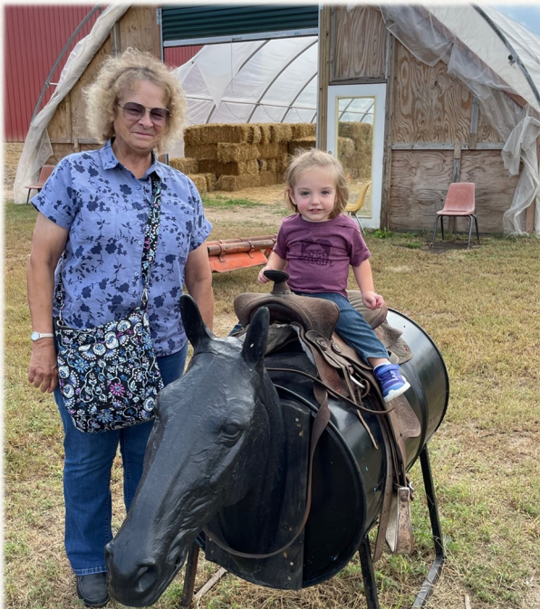
Still likes 4-wheelers the best!